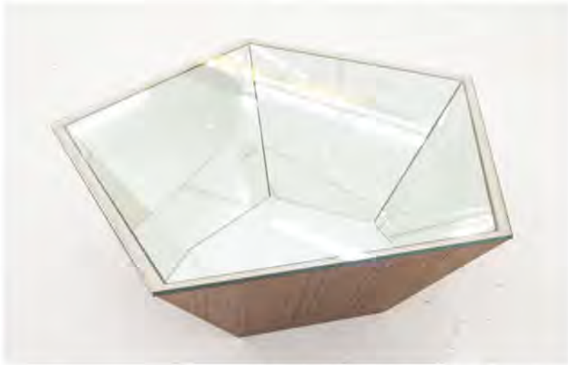
Platonic Coffee Table (Large), 2012: Emmett Moore's work at Gallery Diet is made of Sapele plywood, glass, mirror.

Exhibitions explore gamut — from gender benders and plywood to day laborers